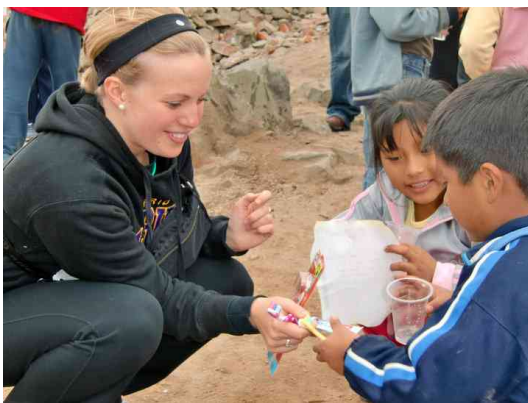
Teaching dental hygiene in Peru

These trips and my personal experiences make me want to be a better person. The lessons I have learned are something that will stay with me always. I look forward to my next trip, and in the meantime will continue to actively learn more about myself by helping others who really need it.