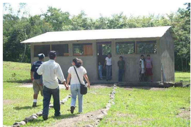
The Finished School in Nicaragua